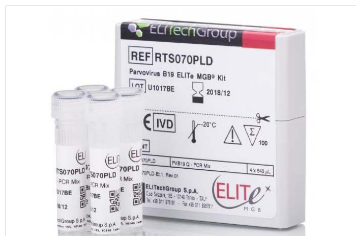
Figure 2: ELITE MGB® Parvovirus B19 Kit – A real-time PCR assay designed for the detection and quantification of B19V DNA. This CE-IVD-validated test is compatible with the fully automated ELITE InGenius® system.

PCR kits like ELITE MGB® , though effective for detecting B19V by targeting conserved genomic regions, may fail to detect rare variants (genotypes 2/3) or mutations in target